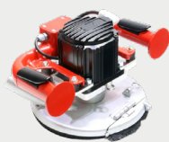
PETIT POTAM PON100322