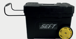
TRANSPORT CASE EP100326