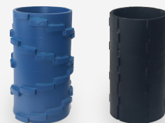
DIAMOND DRUMS Ø100