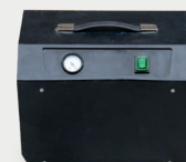
VACUUM PUMP FOR RAIL SUPPORT